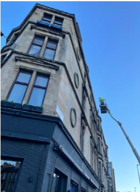
Stage 1: Sur-

Stage 1: Surveying to inform the Scope of Works.