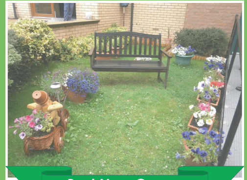
Best New Comer Garden 171 University Ave

Congratulations to all who took part, and well done to winning entries who received a prize of £25.00.