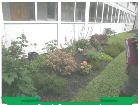
Best Communal Garden - 115 Hyndland Rd/24 Prince Albert Rd

The categories we now have are noted in the Winning Entries below: