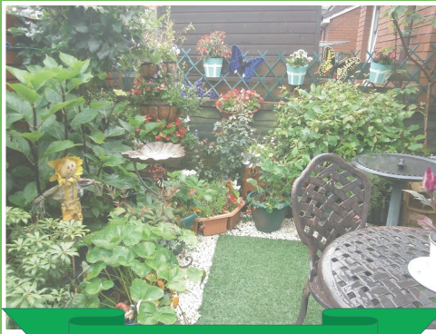
Best Main Door Garden 79 Keith Court